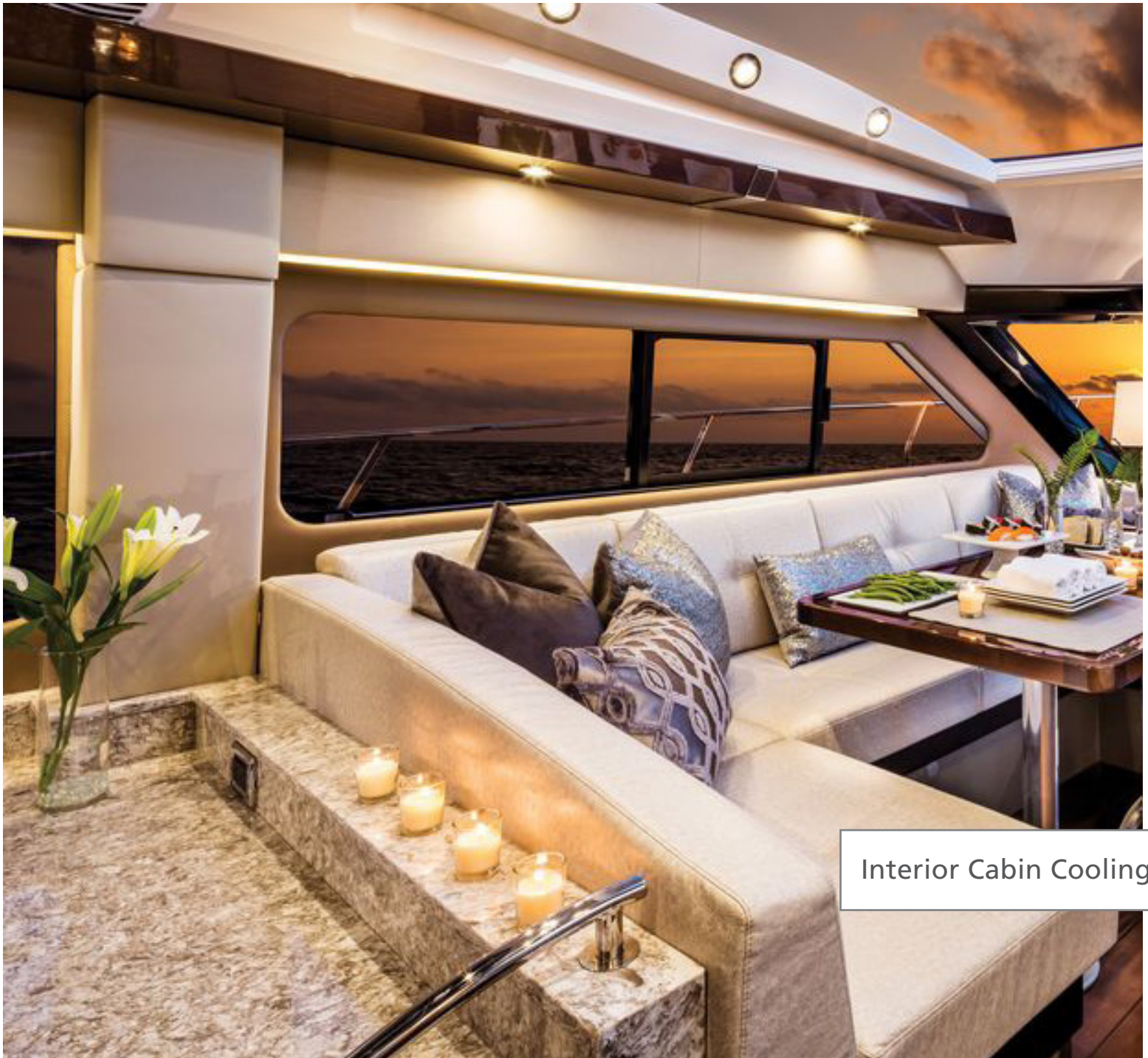
Interior Cabin Cooling